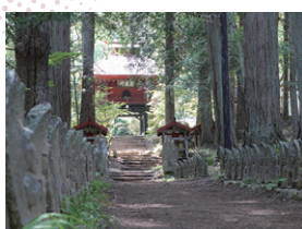
▲Kannon Statues Lining the Path to the Temple