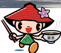
Yamachi Yamagata Village Mascot Character

Along the road to Kiyomizu Kogen are a number of soba restaurants. This area has a long history of using the water from the Karasawa River to turn water wheels in order to grind flour needed to make soba, and even to this day that simplistic taste from the past carries on. There are also many other restaurants where you can try delicious soba within the village.