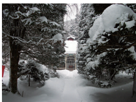
▲Deep snow Covering the Grounds