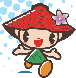
Yamachi Yamagata Village Mascot Character